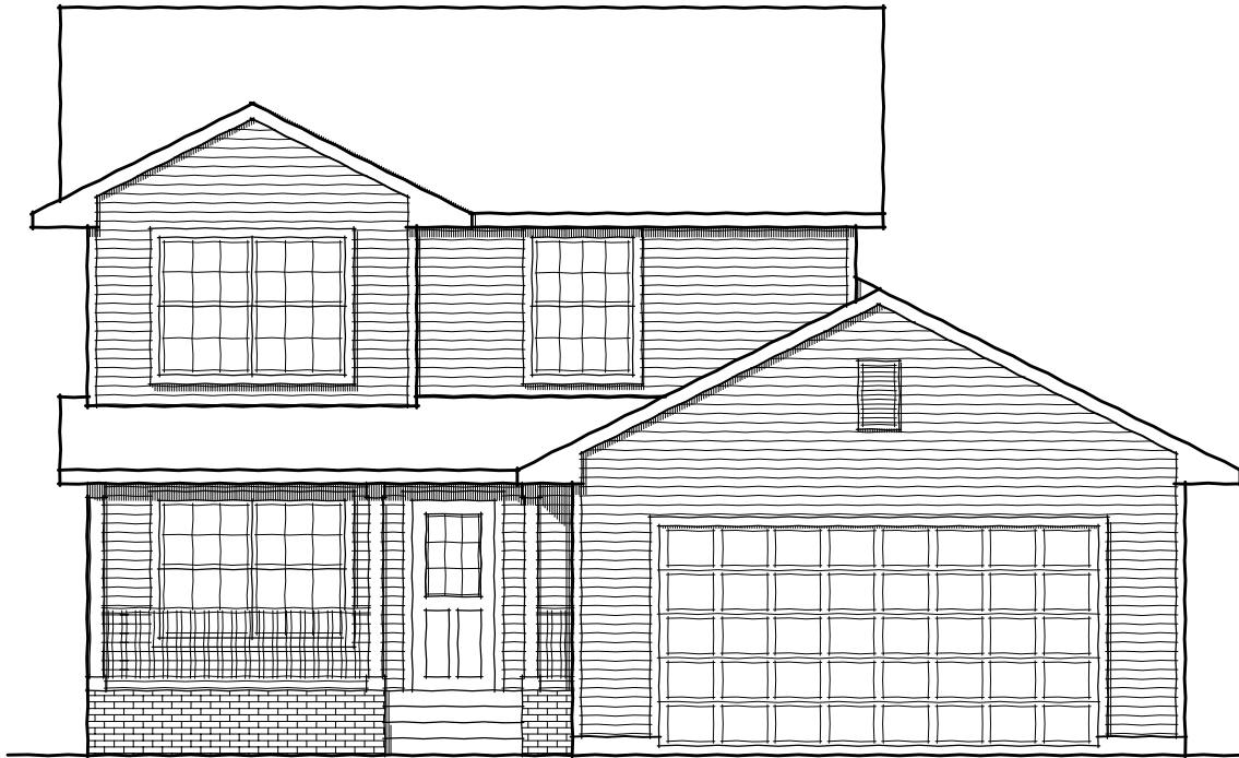
PLAN # 34001