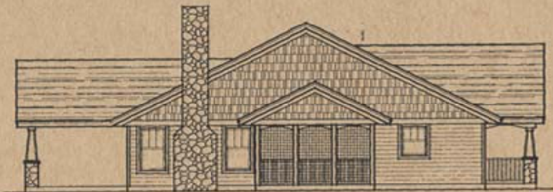
◆ B SIDE