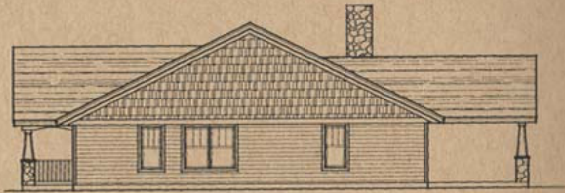
◆ A SIDE