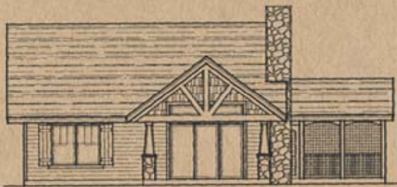
◆ LAKE SIDE