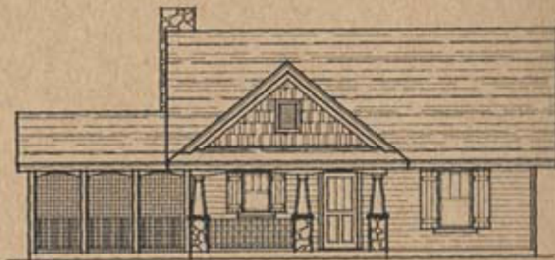
◆ ROAD SIDE